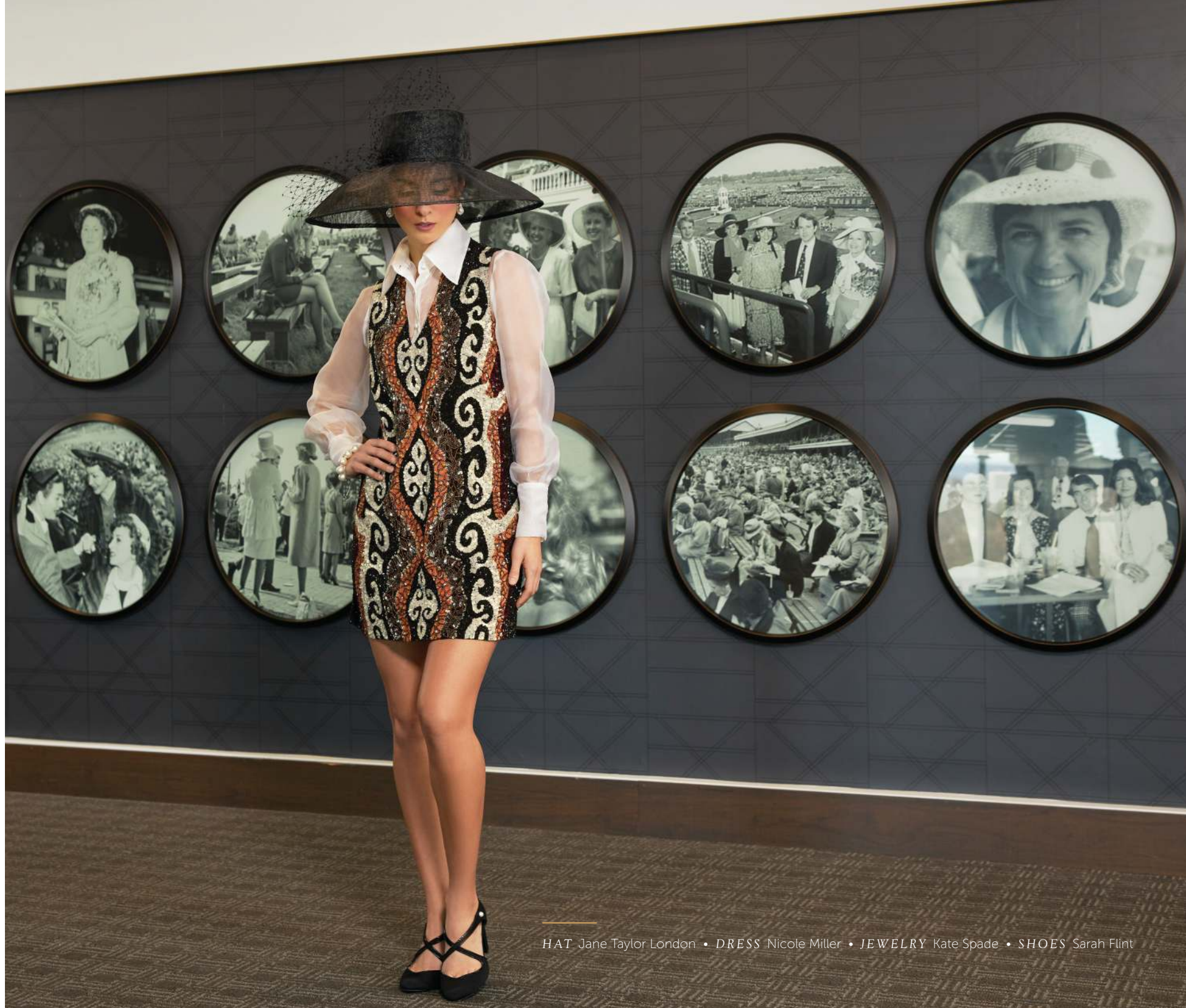
HAT Jane Taylor London • DRESS Nicole Miller • JEWELRY Kate Spade • SHOES Sarah Flint