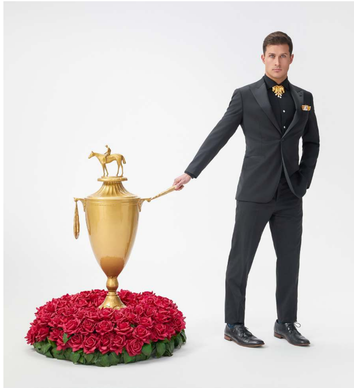
SHIRT Eton • SUIT Munro • BROOCH Elizabeth Taylor