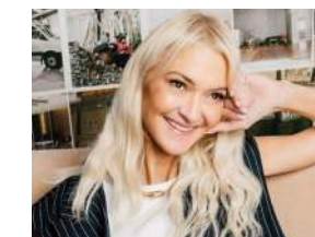
Zanna Roberts Rassi Fashion Journalist, Today Show Style Correspondent Guest Style Editor

Throughout this year's style journey, each look embodies a spirit of celebration and serves as a reminder to embrace your own Derby dreams. Remember that the fashion you choose for the first Saturday in May is not just worn but lived; it should dare to reflect the magic and memories you are destined to create. Dress to delight and enchant as you drift into the Derby of your dreams.