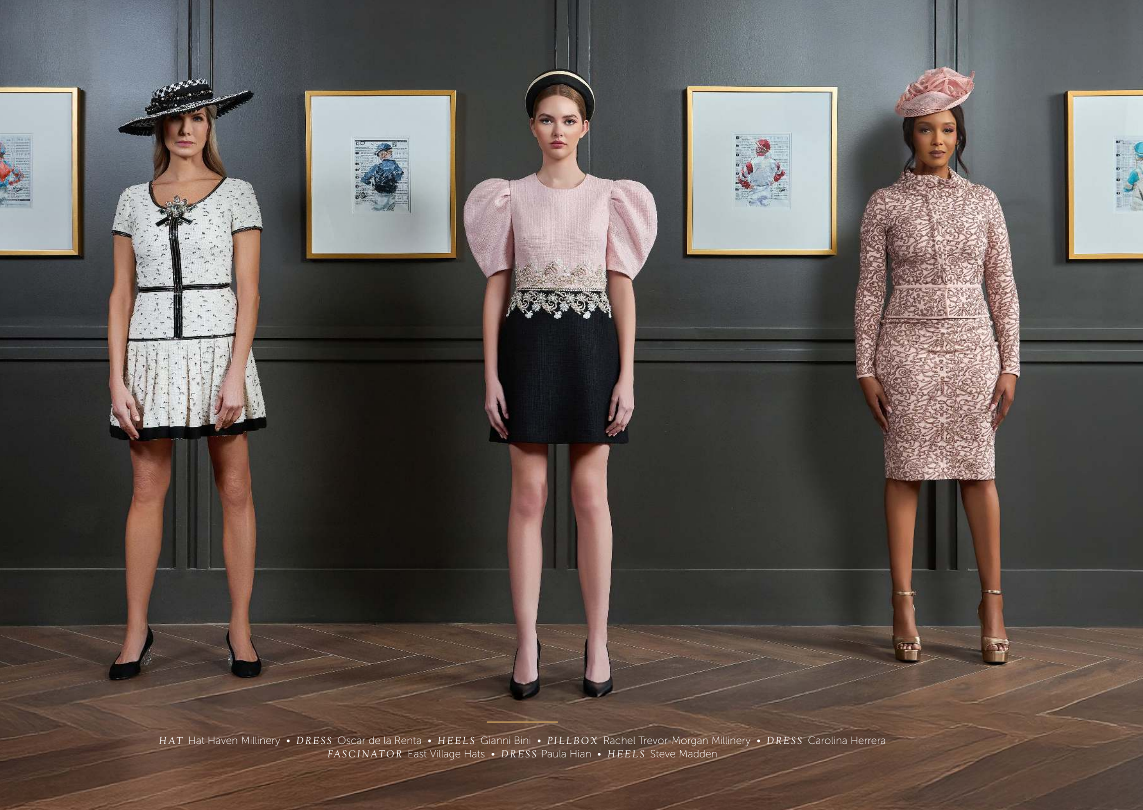
HAT Hat Haven Millinery • DRESS Oscar de la Renta • HEELS Gianni Bini • PILLBOX Rachel Trevor-Morgan Millinery • DRESS Carolina Herrera FASCINATOR East Village Hats • DRESS Paula Hian • HEELS Steve Madden