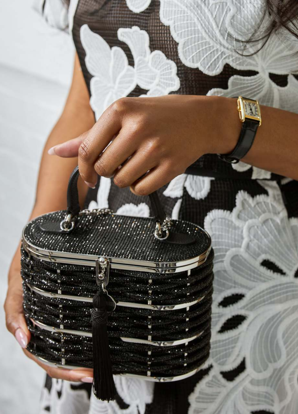
HANDBAG Judith Leiber