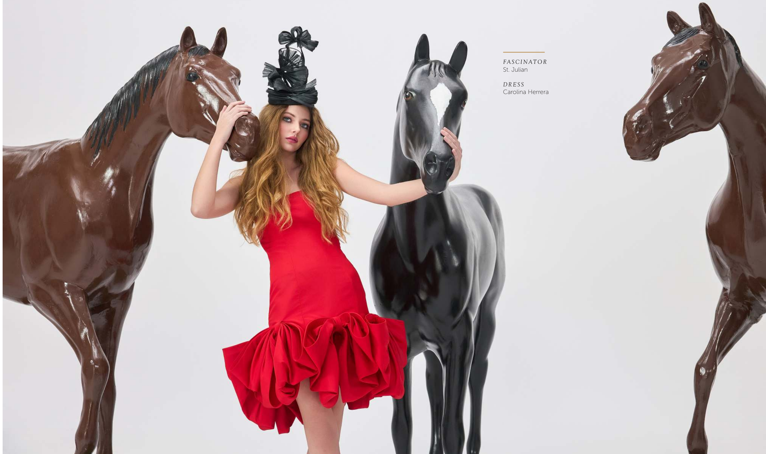
FASCINATOR St. Julian DRESS Carolina Herrera